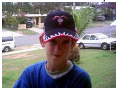
Navy Blue with Red and White Flames