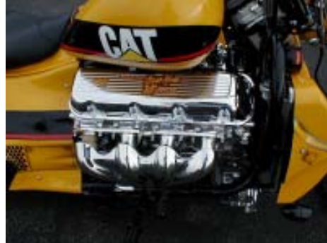
A V8 600 Horsepower Caterpillar - Now thats a Bike!!