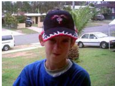
Navy Blue with Red and White Flames